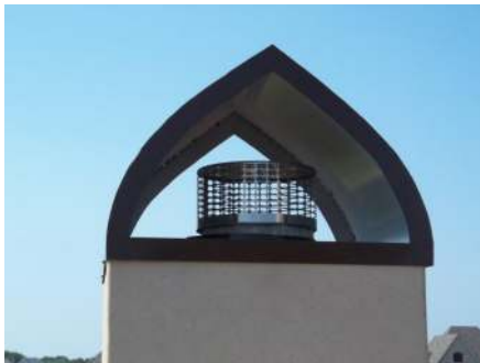
Tear Drop Chimney Cap

We can fabricate almost any style of chimney cap, just send us an idea and we will give an estimate.